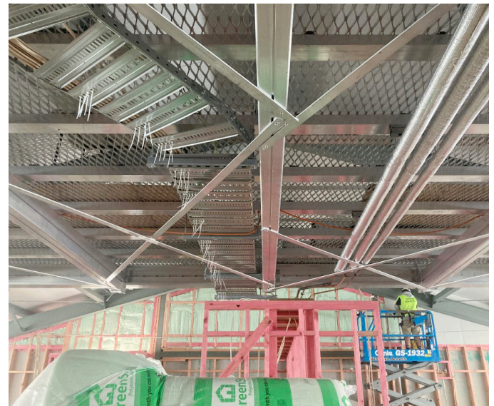
Interior walls and in-ceiling plant room in the new MAPU/EDOA facility are being erected.