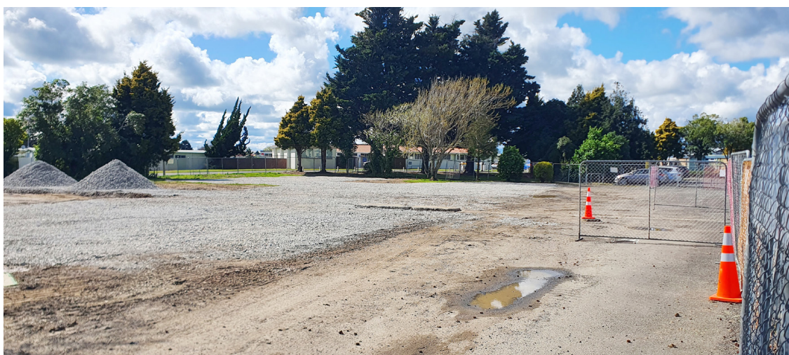
Site now cleared for the new Acute Mental Health Unit.