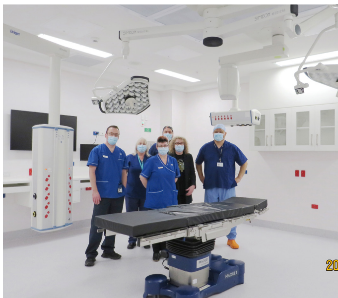
The first of four procedure rooms is now fully constructed.