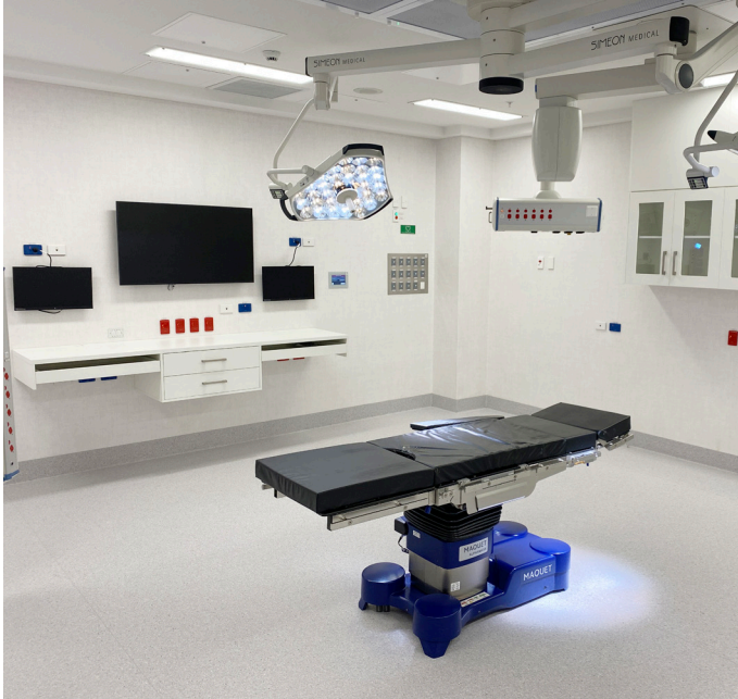
Procedure Room 1 fully constructed.

The next milestone will be the completion of the Day of Surgery Admission Unit and Recovery by the end of October.