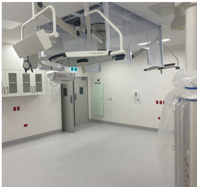
The theatre lights being installed. At the front, right side you can see the theatre pendant in a vertical position, with the vertical side facing.