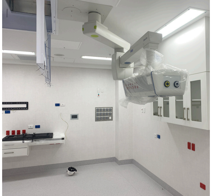
Theatre pendant in place. This is capable of being moved around the theatre bed and provides many services. This end is where the anaesthetic monitors are linked in.