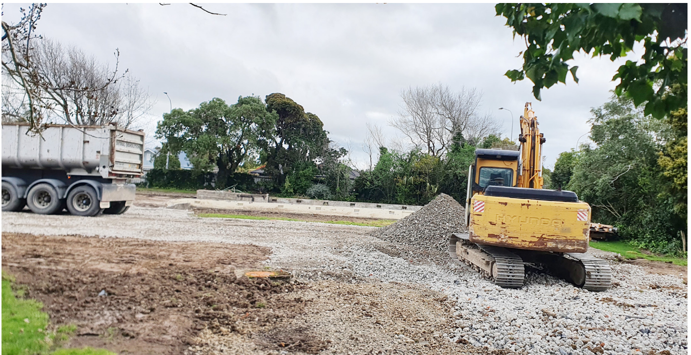
Site being cleared for the new Acute Mental Health Unit.

The next piece of site works is removing trees. Planning for this has been done in conjunction with Pae Ora and local Iwi. It is planned that as many trees as possible will be transferred to other areas of the campus, and Rangitāne Iwi will then relocate as many of the remaining trees as it can. The large Totora trees cannot be transferred and the timber from these will go to Rangitāne and be used for carvings. It may be that some carvings will form part of the new facility.