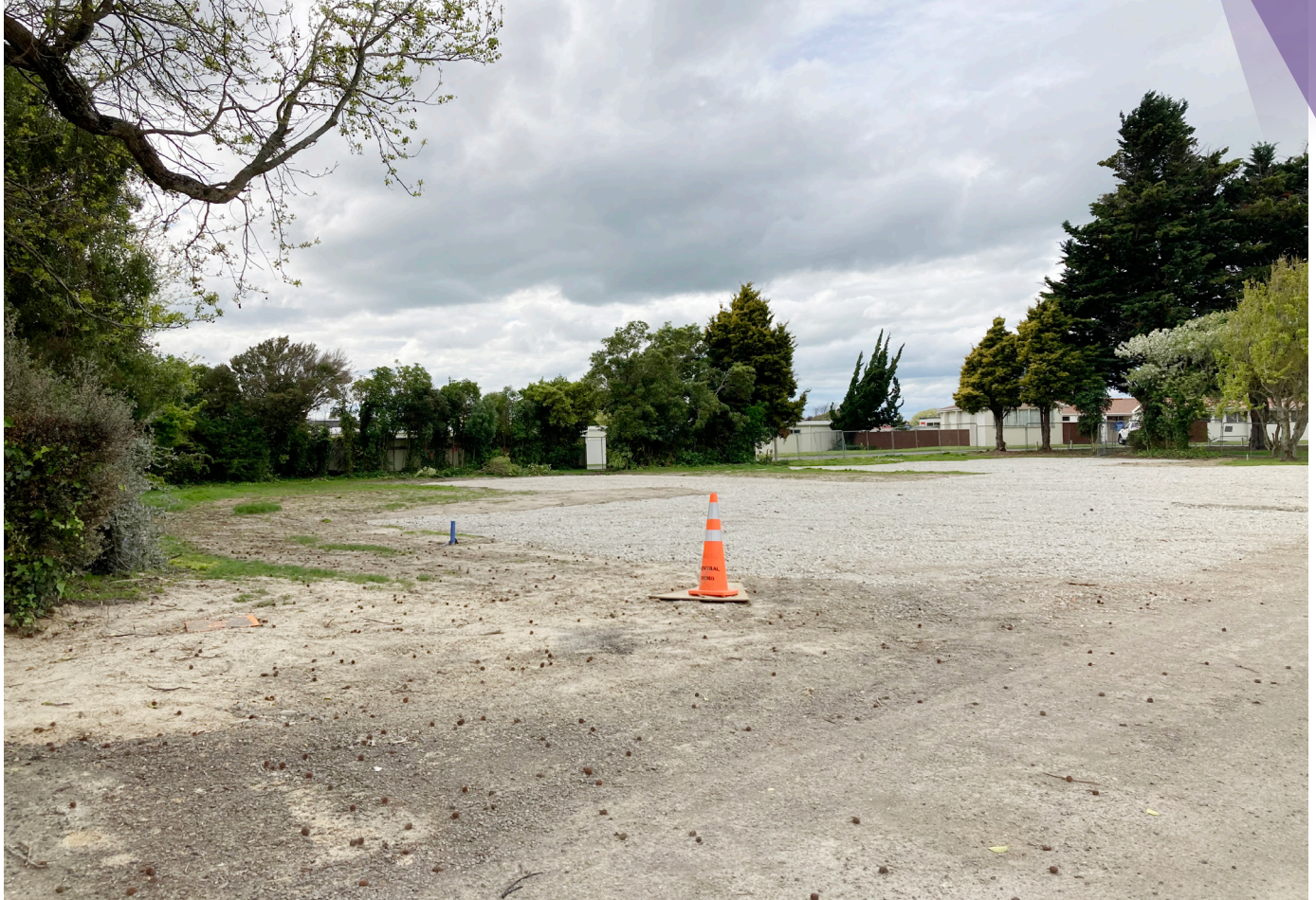
Site now cleared for the new Acute Mental Health Unit.

Following a formal blessing, work will get underway shortly.