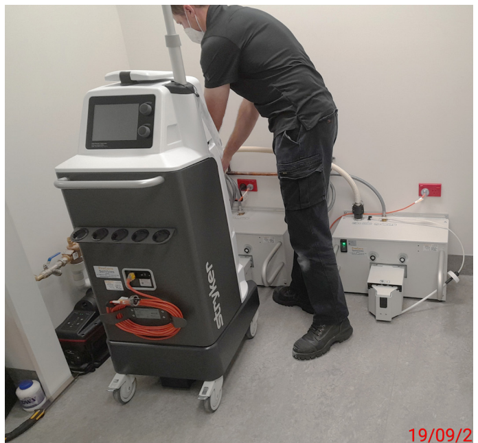
The Neptune machine and docking station being installed. This is a closed waste management system that collects, transports and disposes of surgical waste fluids.