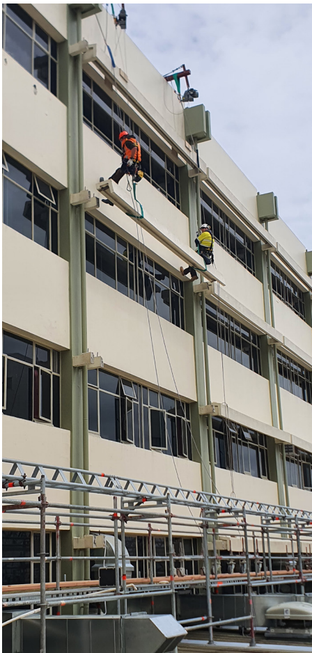
Scaffolders secure next sunshade for removal.