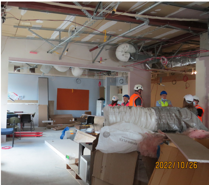
Staff tea and meeting room.