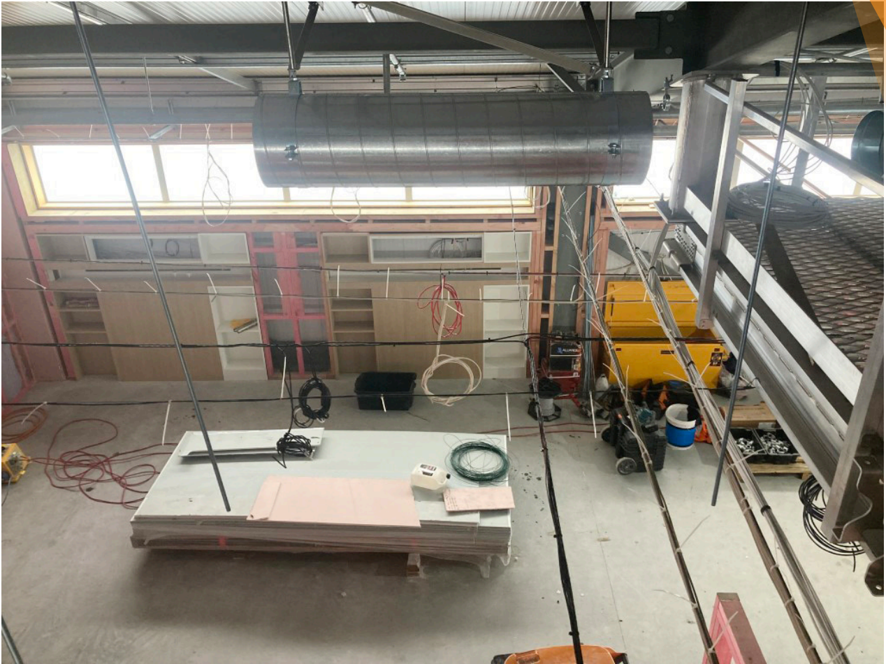
A view from above.