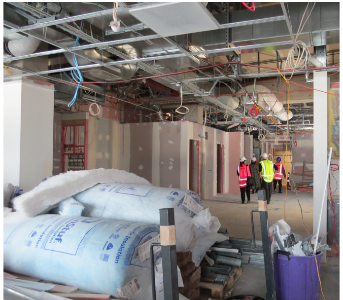
Day of surgery and recovery area painted and vinyl ready for laying.