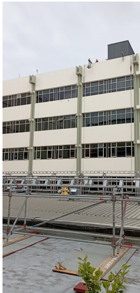
Half the sunshades removed.