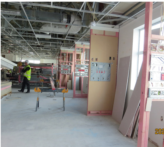
Panels for bed heads in place, with electrical and other services in place.