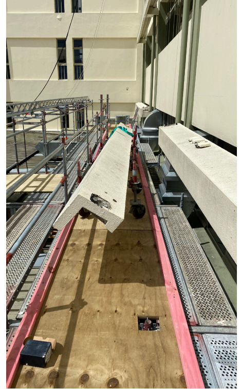
First sunshade placed onto trolley for taking out.