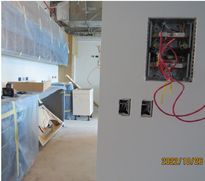
Former renal nurses' station gets new cabinetry for DOSA/Recovery nurses' station.