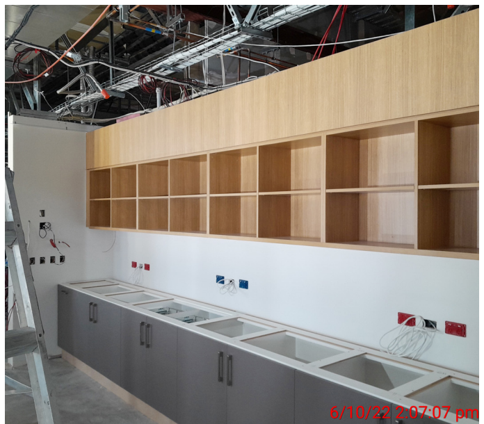
A DOSA/Recovery nurses' station.