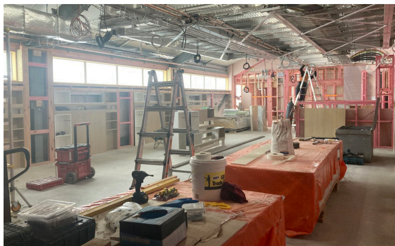
MAPU/EDOA facility will be completed late December.