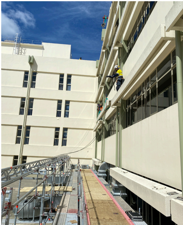
Sunshades coming down to make way for SPIRE and COVID-19 air conditioning work.