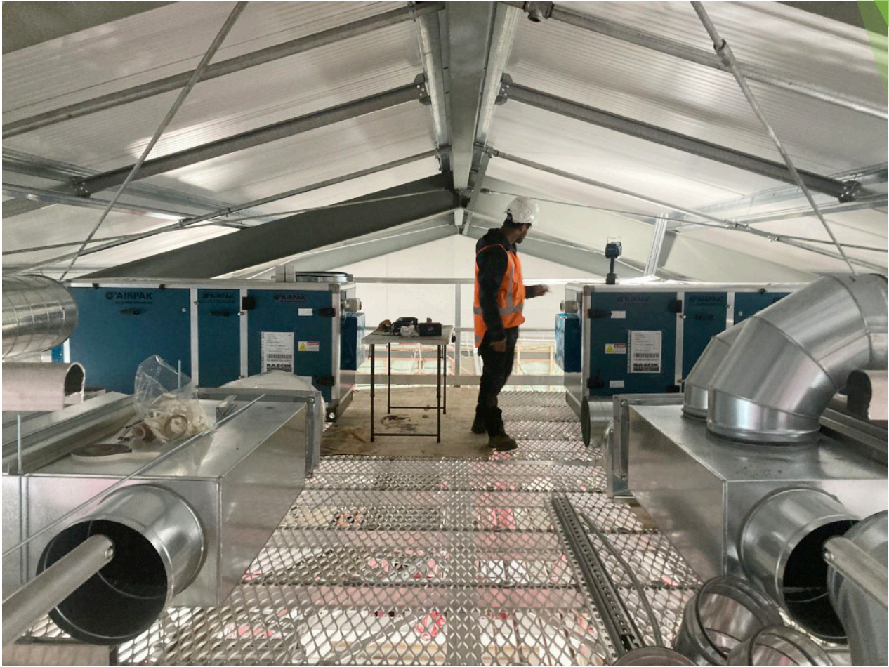
The plant room is taking shape.