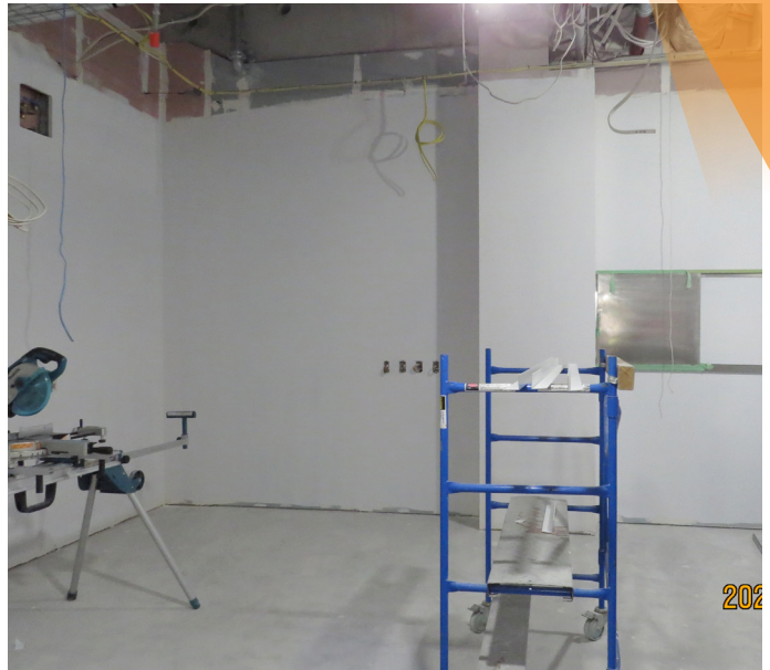
A procedure room.