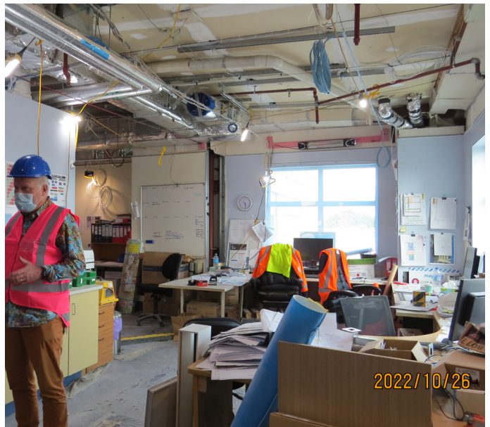
Charge nurses office currently in use as the construction site office.

Work on repairing the roof and installing the roof-top plant roof is underway. This is being done in conjunction with work to establish Ward 26 as a COVID-19 treatment ward. Duct work and HEPA filters will be installed, as well as the air conditioning required for the new theatre area.