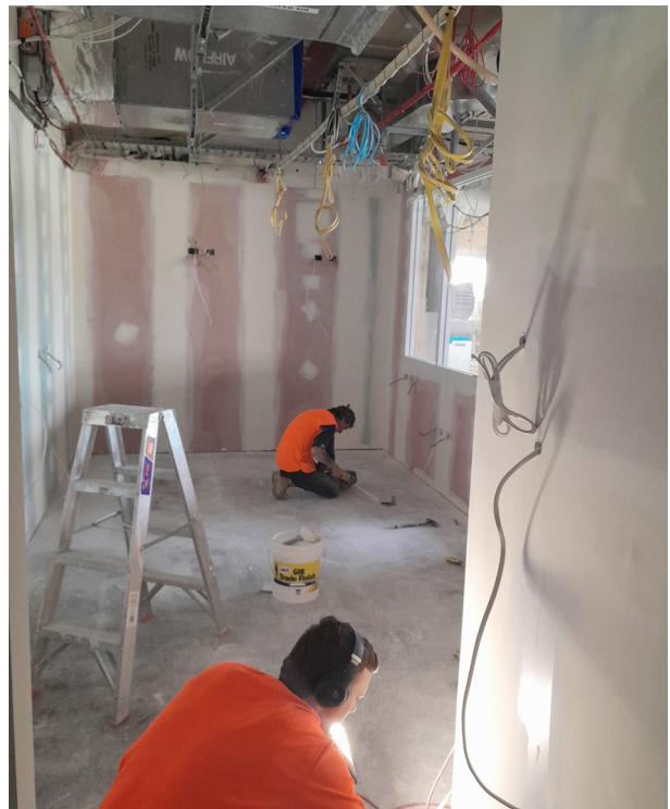
Construction of DOSA, Recovery and Gastroenterology areas continues with a December 2022 completion date.