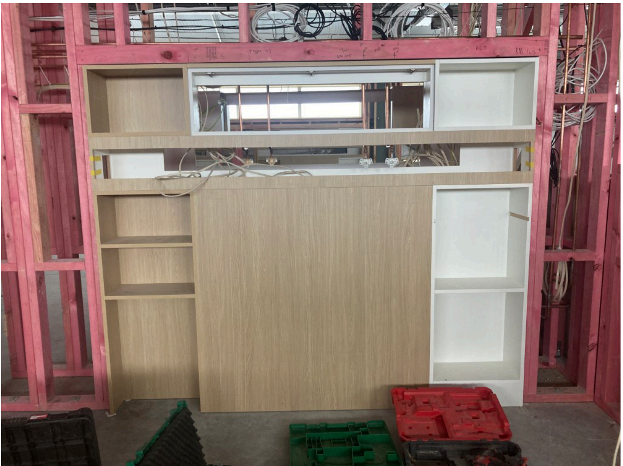
The bed panel.