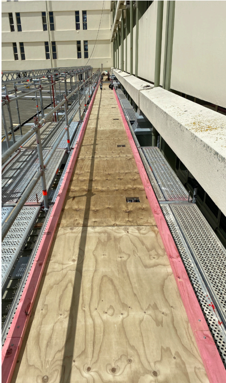
Scaffolding and gear in place.

The concrete sunshades on one side of the clinical services block had to be removed and this work started in mid-October and was finished by the end of the month. A tent is being installed on the roof to enable the remedial work to occur and this is on track for being in place on 7 December. It is recognised that the work will be noisy and the project is working closely with hospital services to manage this, and maintain patient privacy and comfort, as best as possible.