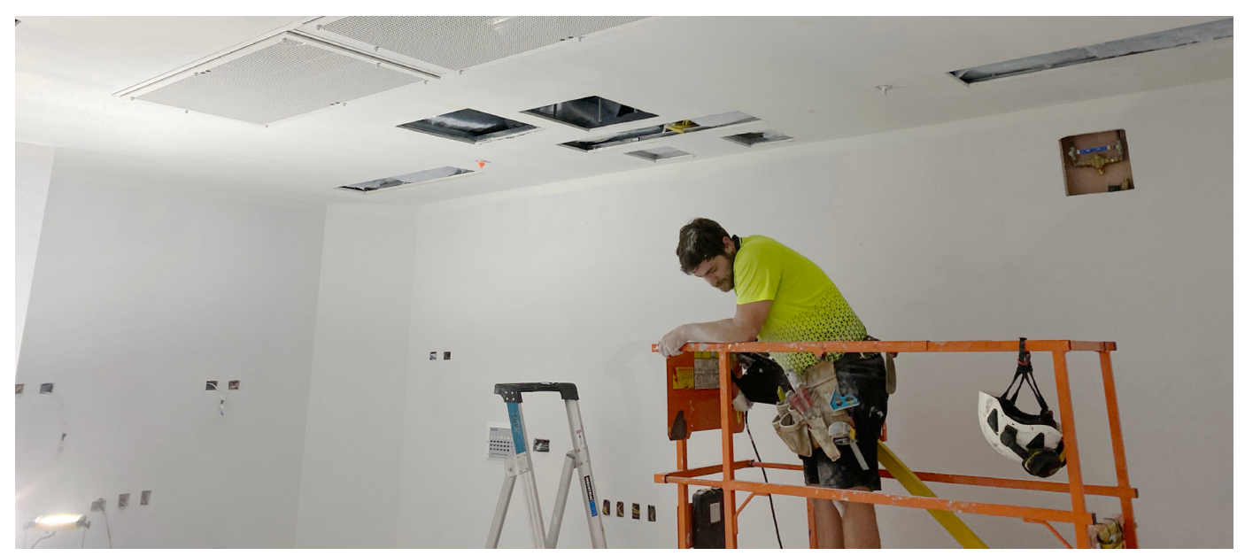
Finishing trades at work.

Supply issues and COVID-19 continue to challenge this project. The new Day of Surgery Admission and Recovery areas are scheduled for completion by mid December, with the intent to commence operation prior to Xmas. Between then and go-live, clinical and digital equipment will be put in place and tested, the area will be cleaned and stocked, and staff oriented to their new work space. There is a lot of people and services involved in this process.