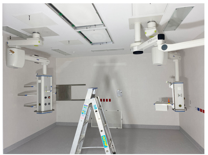
One of the new procedure rooms.

Gastroenterology, including Procedures Room 2 and 3, will then be completed, followed by the staff offices. This completes the bulk of Stage 1.