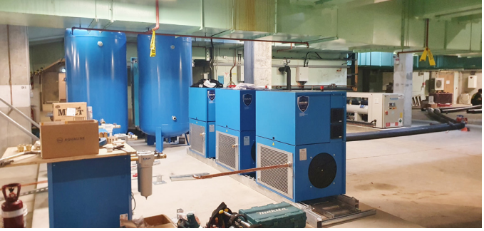
New medical air system being installed