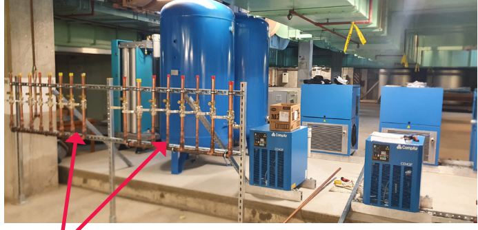
The new medical air system is taking shape, with the manifolds which regulate the air flow to the hospital being installed.