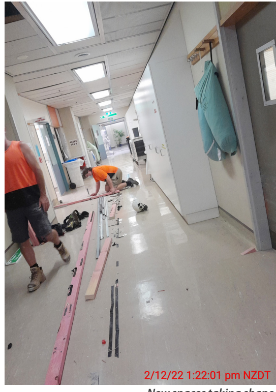
New spaces taking shape.