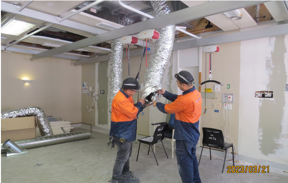
Pipework for the new air handling system being installed in the ceiling.

When the hospital was built back in the early 1970s, windows provided the ventilation system. These do not provide the air control required to manage air-borne infections such as COVID-19.