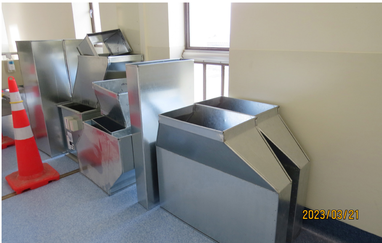
Parts of the air handling system ready for installation.