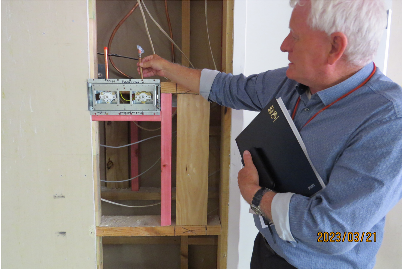
Medical vacuum and oxygen systems being installed at each bedside.

The opportunity is also being taken to upgrade the Ward’s lighting while it is empty of patients, and fit out two rooms so they are capable of supporting dialysis patients who are in hospital for other medical conditions.