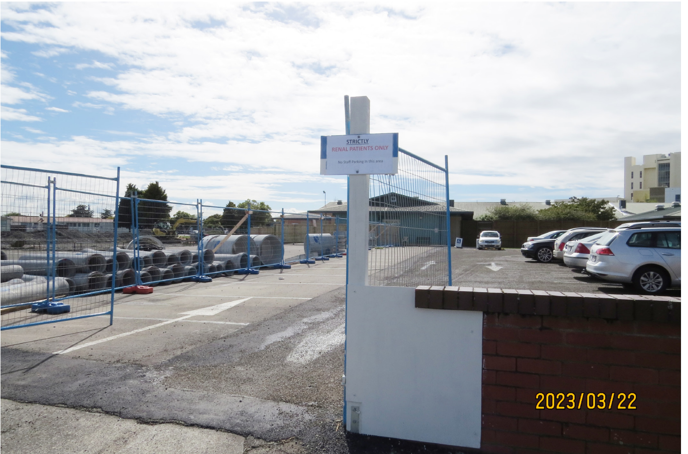
New car park for renal patients, accessible from Heretaunga Street.